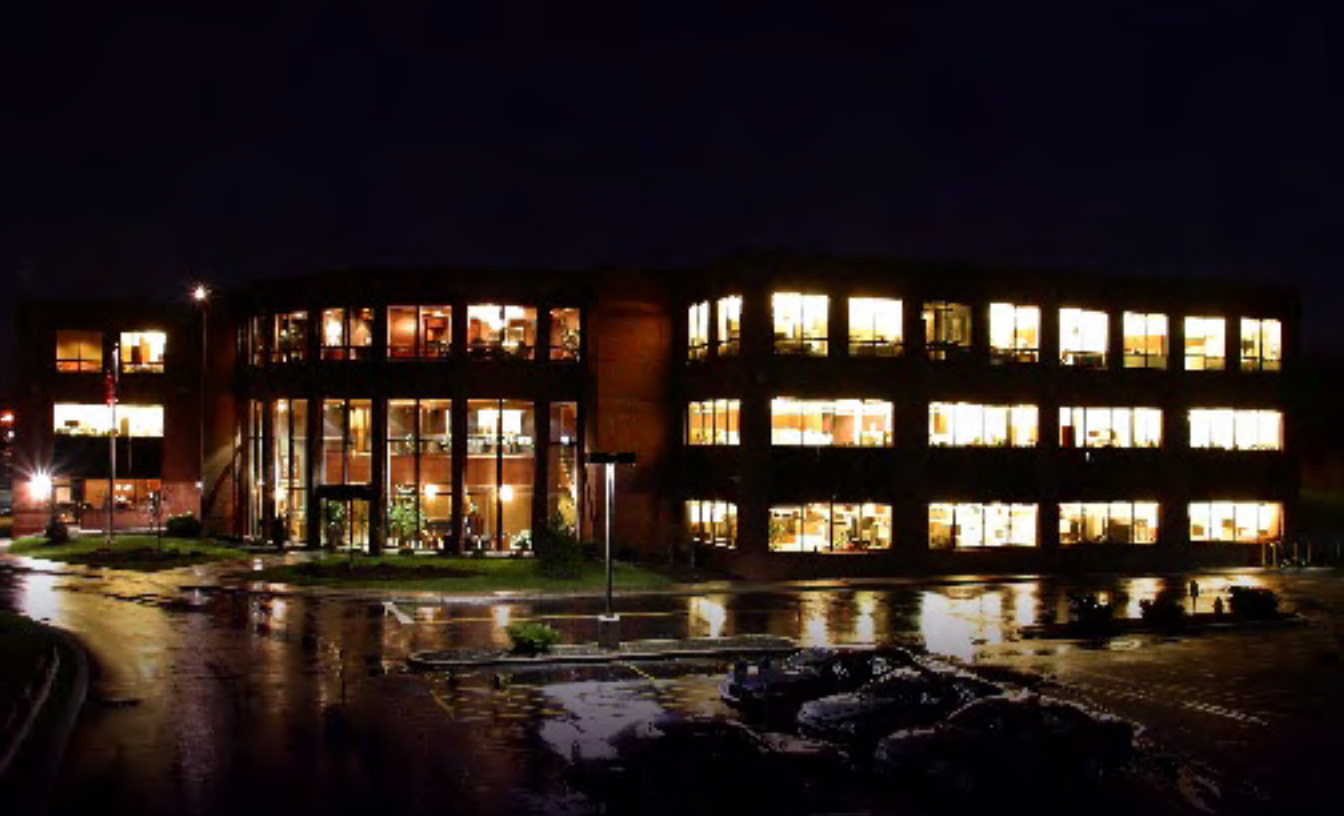
PAETEC CORPORATE HQ FAIRPORT, NY