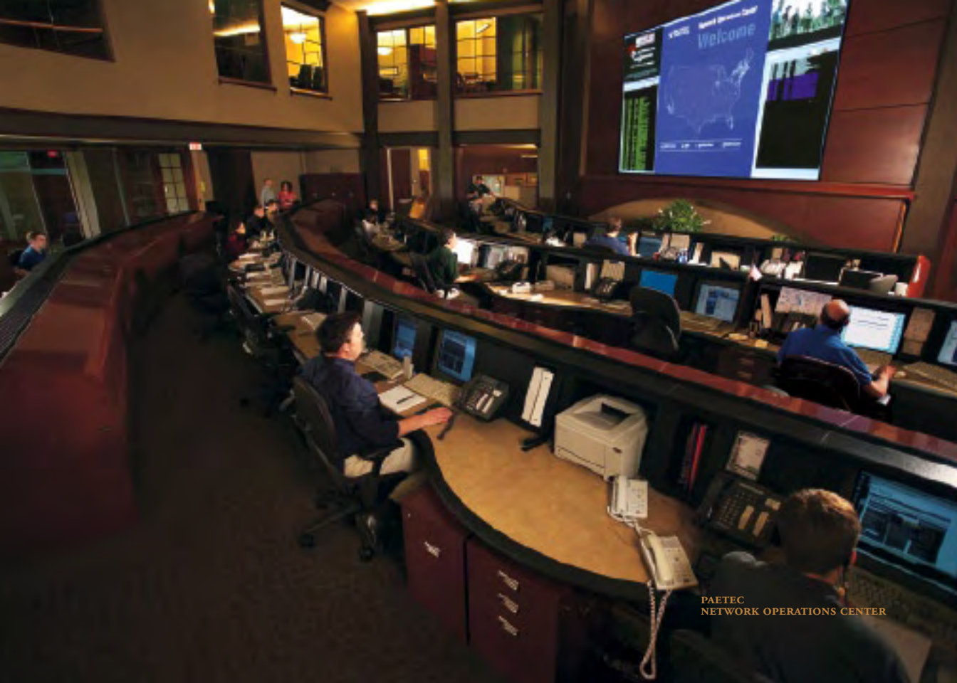
PAETEC NETWORK OPERATIONS CENTER